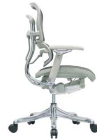
V210MEBLK Black Mesh/Grey Frame