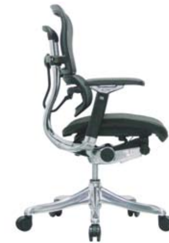
V200MEBLK Black Mesh/Black Frame