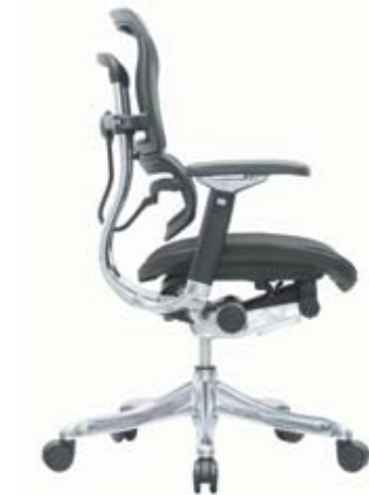
V200FBLK Black Fabric/Black Frame