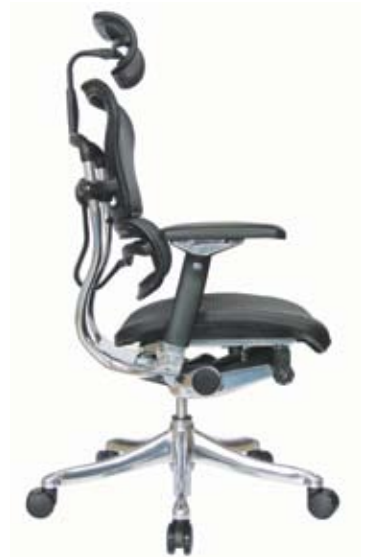
V200HRBLK Black Mesh/Head Rest Option