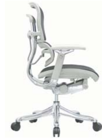
V210FBLK Black Fabric/Grey Frame