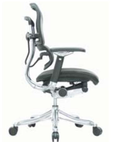
V200BLKL Black Leather/Black Frame